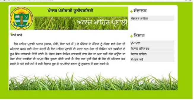
Fig. 3 Home page of web based expert system

The administrator can add and update the information in Punjabi language by using a Punjabi keyboard. The registered users can view the diagnosis information for the leaf disease of a cereal. They can also upload the image of infected leaf and system will compare the uploaded image with images in database to detect the disease.