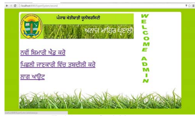
Fig. 4 Home page for administrator