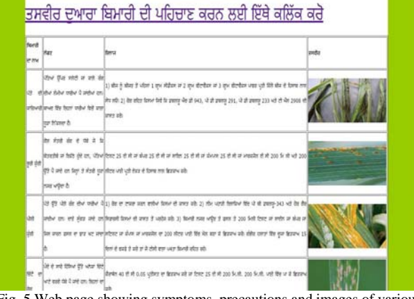
Fig. 5 Web page showing symptoms, precautions and images of various leaf disease of wheat

When a farmer login into the system and select his required crop then symptoms, precautions and images of all the leaf disease of that crop are displayed as shown in fig. 5. If the farmer however is unable to understand the displayed information he can upload the image of his infected leaf. The system will compare the uploaded image with the images in database and will give the farmer appropriate results.